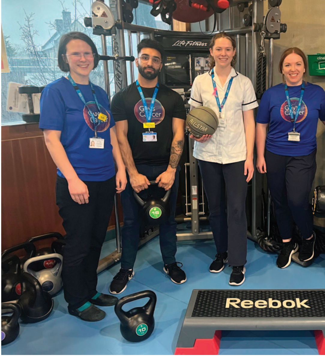
The cancer rehab team in the Guy's Cancer Centre gym

Did you know that exercising during cancer treatment has lots of benefits, including reducing anxiety and fatigue?