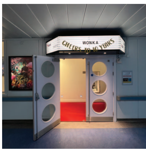
The entrance to the MediCinema complete with