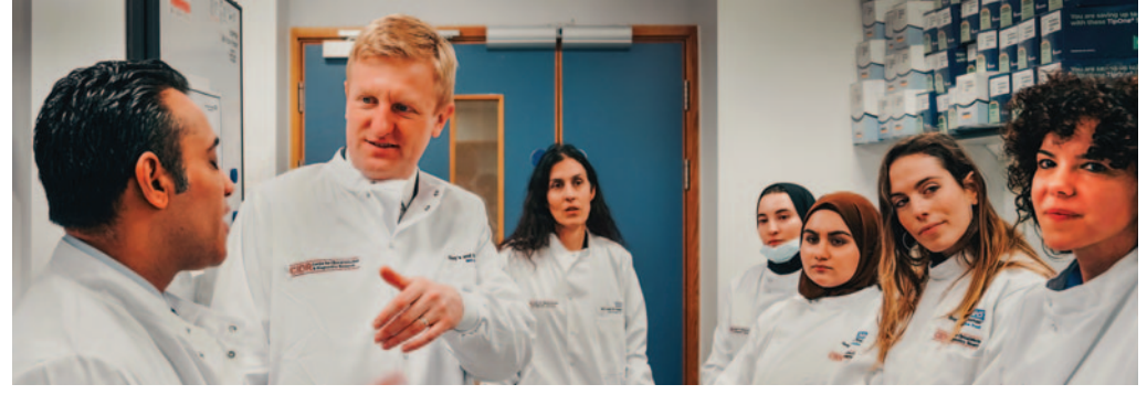
Deputy Prime Minister Oliver Dowden visits the team

A rapid genetic testing pilot is being rolled out to more hospitals and their patients, following a successful trial at the Trust.